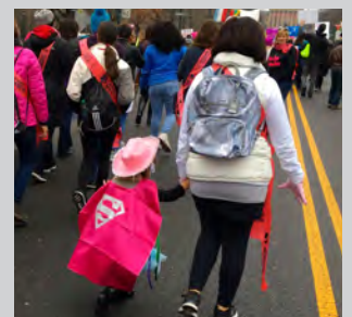
Women's March Philadephia, January 21, Logan Circle. A sea of marchers everywhere you turn.