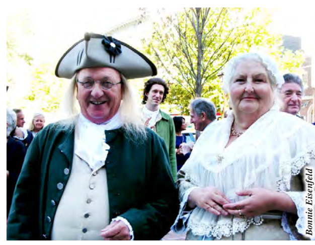
Costumed historical reenactors from the American Revolution period.

For more information, to read historical excerpts, to join the email list, and to donate, please go to https://www.amrevmuseum.org/