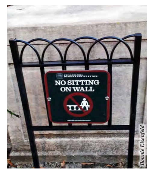
The short-lived sign.

(Sources: Friends of Rittenhouse Square letter to members and Inquirer article, Jan. 14, 2017.)