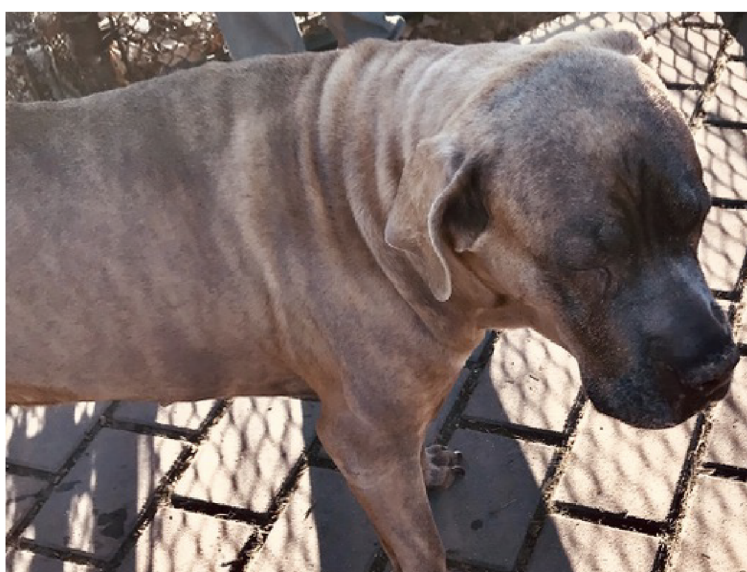
RIP Sweet Ollie.