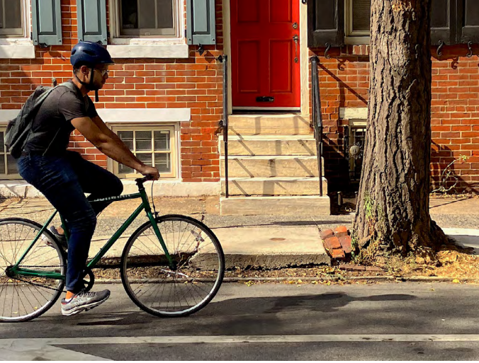
1500 block of Pine.

Below we have a picture of a bicyclist using the streetwall as a theatrical backdrop. There's a quiet intimacy in this photograph that I find attractive—can we say peaceful?