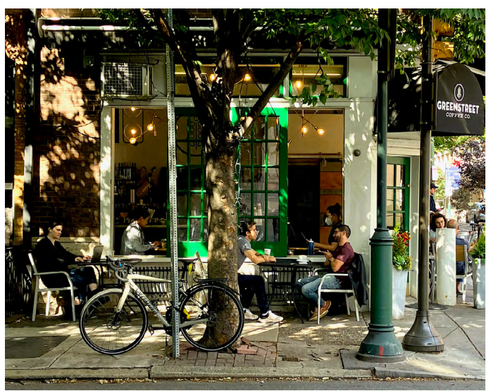
Spruce at 11th.

But pedestrians and their allies, such as bicyclists and restaurateurs, have shown themselves to be a tenacious lot, and they're ingenious about inserting little pieces of civilization where they can.