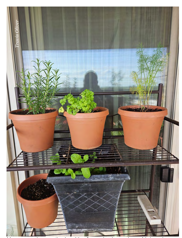
You can enhance the health of your herb garden with handy homemade fertilizer hacks.

I hope these gardening hacks help you as much as they help me. If you have any questions, feel free to reach out to me at <u>centercity@centercityresidents.org</u>. Happy gardening!