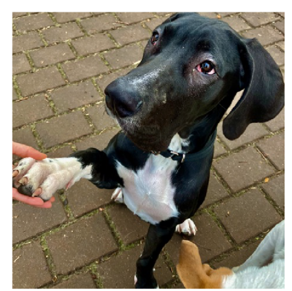
Be my friend?