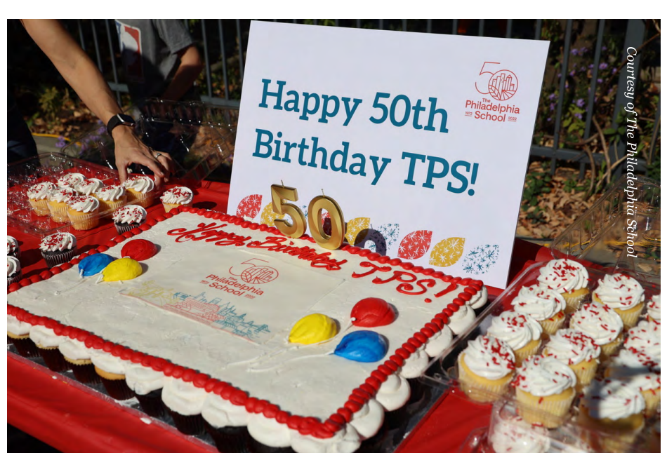
The Philadelphia School is 50 this year.

The Philadelphia School (TPS) is an urban, progressive school in the Fitler Square neighborhood that educates students from all over the city. Serving children in preK through 8th grade, TPS is a leader and wholehearted champion for the progressive principles of education on which the school was founded 50 years ago.