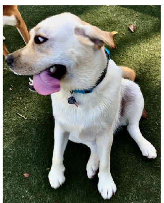
It flew where?