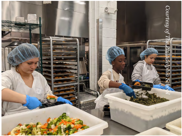
Eighth graders participating in their service project to help prepare meals.

In January several alumni, as well as past and present faculty and staff, attended school in person and virtually to help students understand the history of the school. Each of the school's 23 family circles (a vertical grouping of lower and middle school students) was assigned two or three years of TPS history to research and come up with questions for the alumni historians. After interviewing the alums, students created posters of their findings, creating a visual timeline of the school's development, which were on display at our May 5th spring celebration.