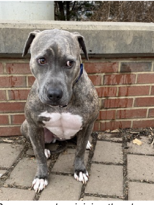
Popeye ponders joining the playgroup.