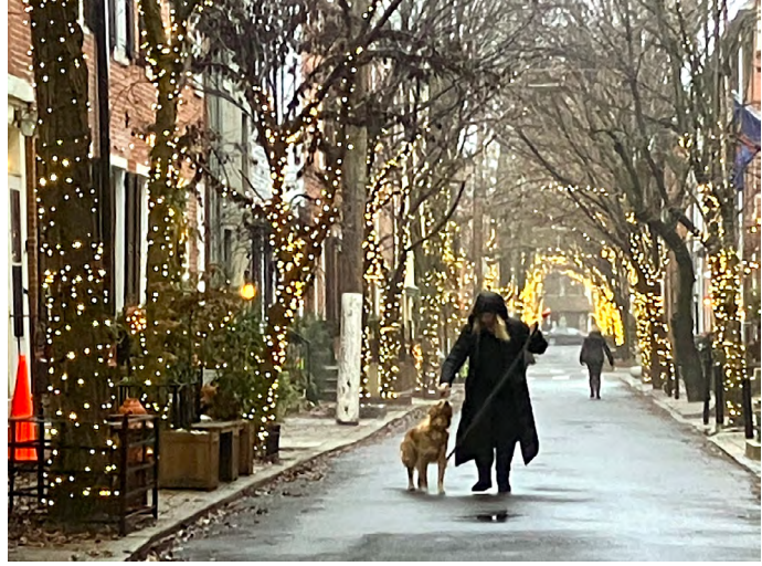
A damp day on Addison Street.

People who live in the inner parts of this necklace can walk 15 minutes to a job in a monumental office tower—a commute that is inconceivable in many American cities. Thanks to the proliferation of bike lanes, people who live a bit further out in the necklace can readily commute by bicycle to work in the core.