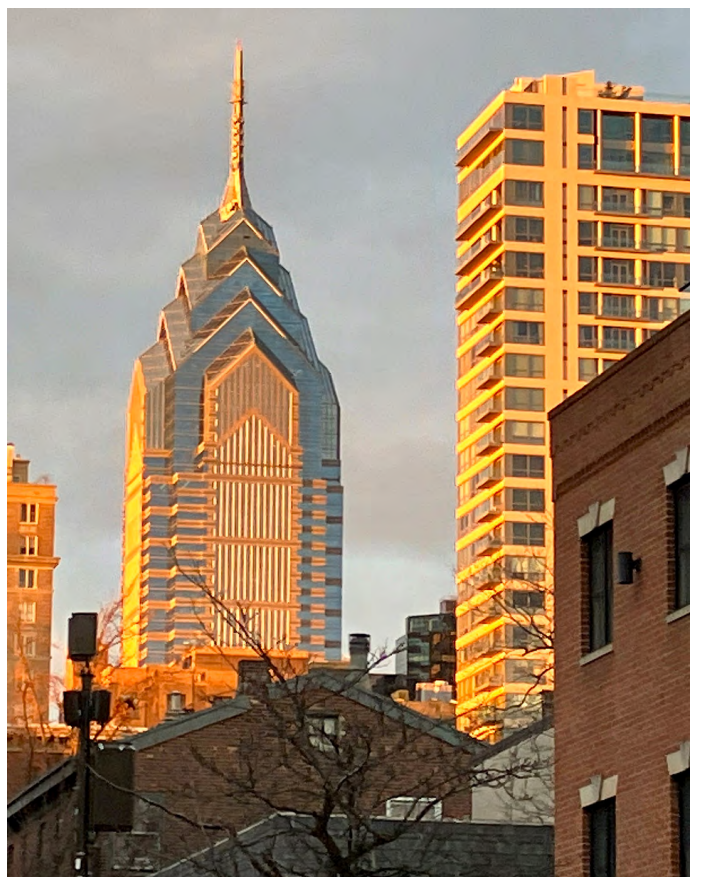
High-rise, One Liberty Place, in the background; low-rise residential in the foreground.

Center City Philadelphia comes in two pieces. First is the monumental city that draws office workers, shoppers, suburbanites looking for a decent restaurant, museum lovers, and general-purpose tourists. The monumental city is surrounded by another, more intimate city. This largely lowrise area flings a necklace of neighborhoods around the often very tall buildings in the downtown core.