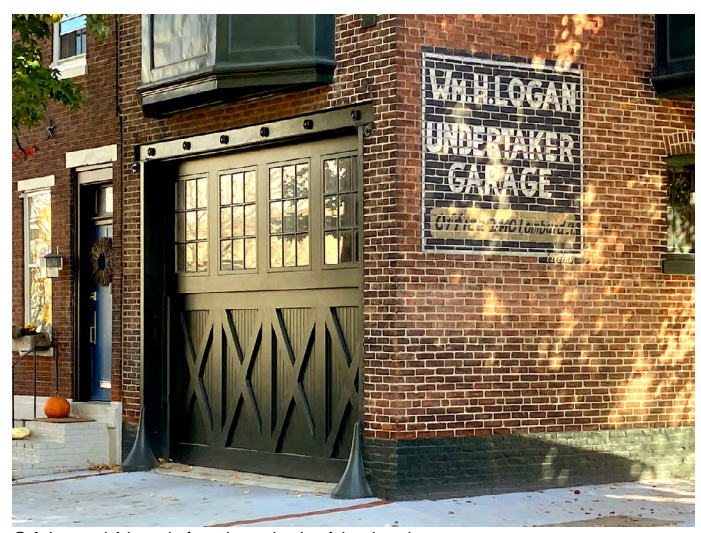
24th and Naudain, dappled with shade.

I can't resist one more. Let's hear it for the contribution that shade trees can make to the mood on a street.