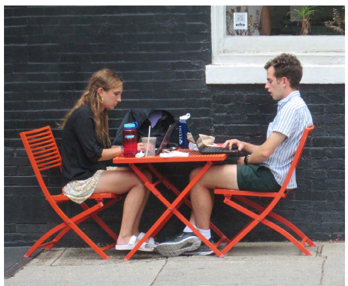
Interesting colors at 20th and Locust.

There is a risk of stereotype, however. I've written before about the surprising variety of color available in the neighborhoods of Center City. (See: <u>Which Side Are You On?</u>) Here's a relatively recent addition, mixing black, white, and red very nicely.