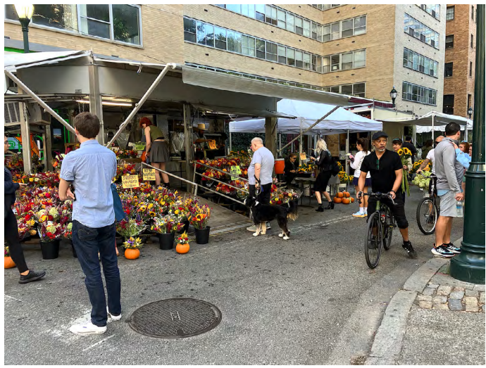
Farmer's market, 18th at Walnut.

And I think it's time to raise the bar. We need not just a walkable city, but a walking city. Like, you know, putting the farmer's market in the middle of the street instead of up on the sidewalk.