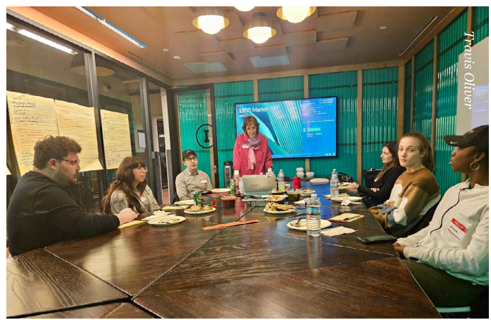
A recent focus group looked at ways to engage Center City's "under-40" demographic with CCRA.

A second focus group for non-members was planned for May 17 to further gauge how CCRA can attract and respond to the needs of these younger members; check CCRA This Week for more updates.