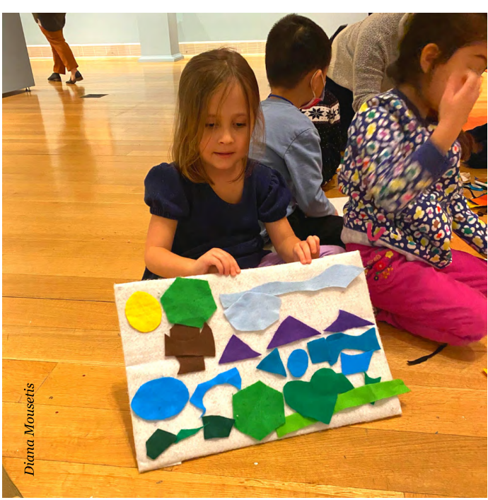
A proud student with her creation.

Greene Towne serves children 18 months old through third grade and is the only Montessori school in Philadelphia that is accredited by the American Montessori Society. Greene Towne holds a four-star rating through the Pennsylvania STARS program and is accredited by the Pennsylvania Association of Independent Schools. Greene Towne is accepting applications for 2023-2024. Please visit www.gtms.org to learn more.