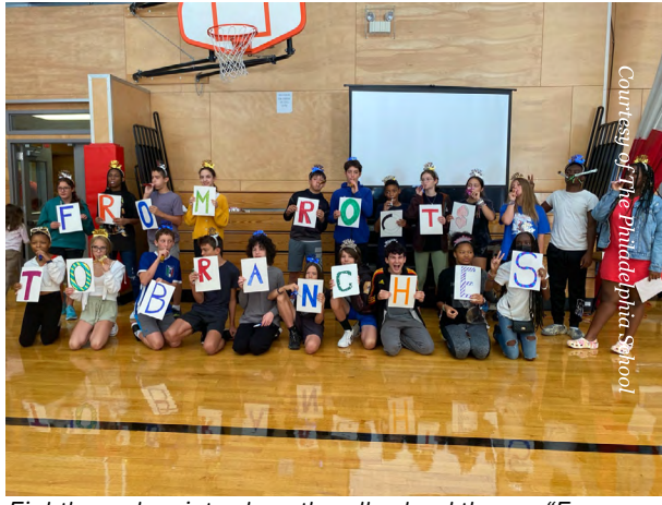
Eighth graders introduce the all-school theme, "From Roots to Branches," in the fall.

Lastly, this spring students are diving deep into environmental stewardship, learning more about how we care for the earth.