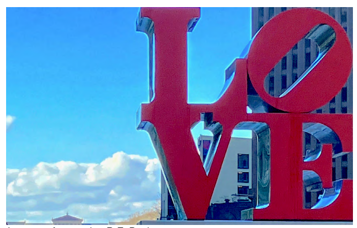
Love to Art on the B.F. Parkway.

And let's close with a man-made view corridor, the Benjamin Franklin Parkway, with the LOVE statue in the foreground and a hint of the Art Museum in the distance. Although I confess I was more interested in the unusual cloud formation when I was taking the picture.