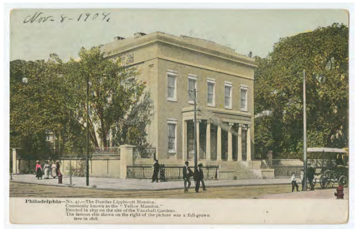
The Dundas-Lippincott Mansion: Commonly known as the "Yellow Mansion," erected in 1837 on the site of Vauxhall Garden. The famous elm shown on the right of the picture was a full-grown tree in 1818.

A background note about London's Vauxhall Gardens (namesake of Philadelphia's Vauxhall Garden): From the mid-1600s to the mid-1800s, the Vauxhall Gardens were one of the leading venues for public entertainment in London. Consisting of several acres of trees and shrubs with attractive walks, the site was not formally named Vauxhall Gardens until 1785 when it started charging admission for its attractions. The Gardens featured concerts, hot-air balloon ascents, fireworks, and tightrope walkers.