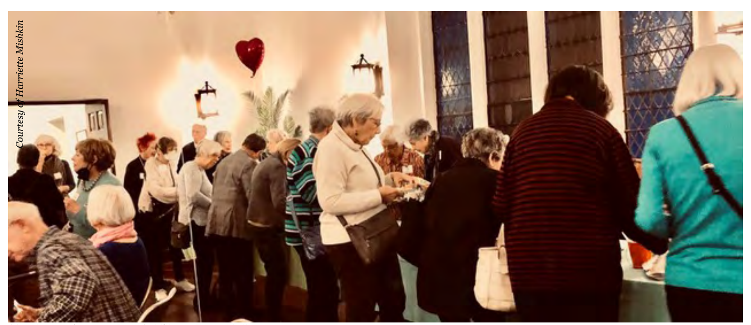
Members mingle at Penn's Village Town Hall.

You can be part of this thriving community in central Philadelphia. Check out our <u>website</u> to learn more about how Penn's Village supports older adults who wish to stay in their own homes by providing volunteer services and educational and social programs.