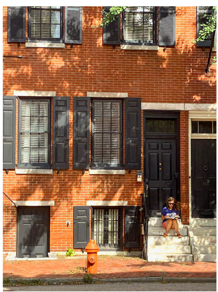
S. Carlisle Street from Waverly.

Speaking of peaceful, how about sitting on your stoop (below) and reading a book on a warm sunny day, with a little help from a nearby shade tree?