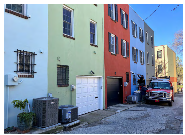
Mediterranean colors on Cypress Street.

I wrote a whole story about the <u>2400 block of Cypress</u> back in 2017. I felt moved to go back and take a new picture. These façades had all been a uniform white, somewhat grayish from age. The homeowners banded together and came up with—I think—a better idea. And one that is aging very well.